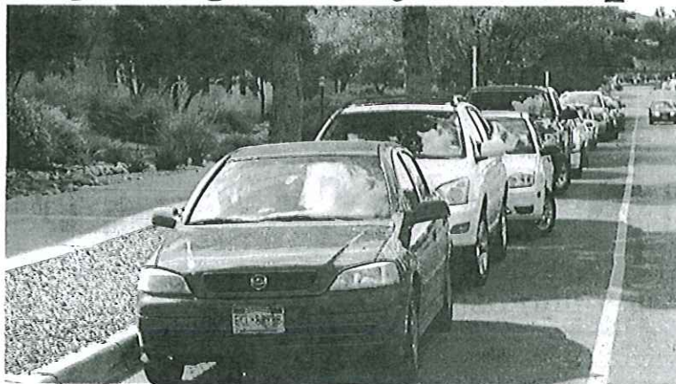
Vehicles are parked on Oregon Street after the city recently removed "no parking" signs.

For years, residents of Kern Place have complained about students and Cincinnati Avenue pa-